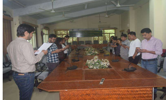
Fig-3: Integrity Pledge at ICFRE-LEC, Agartala, Fig-4:Integrity Pledge at ICFRE-BRC, Aizawl