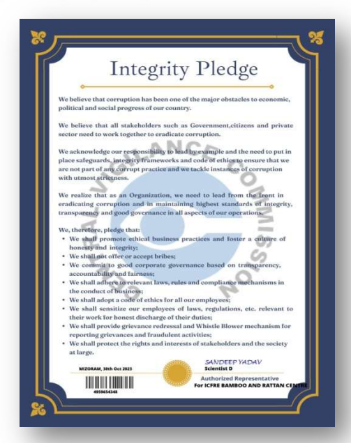
Fig-6:E-Integrity Pledge as an organization of ICFRE-BRC, Aizawl