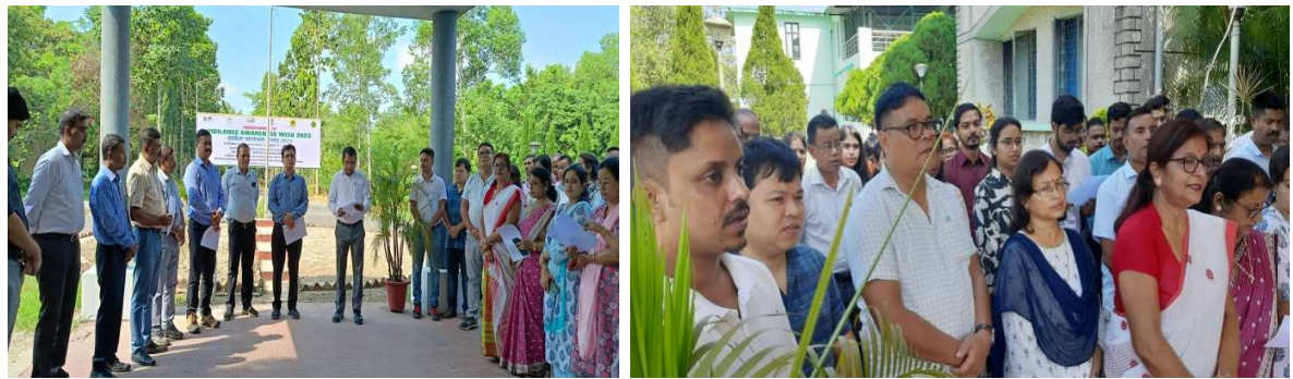
Fig-2: Taking Integrity Pledge at ICFRE-RFRI, Jorhat