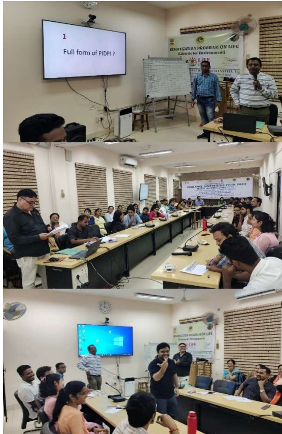
Fig-10: Some glimses of Quiz competition at ICFRE-RFRI, Jorhat