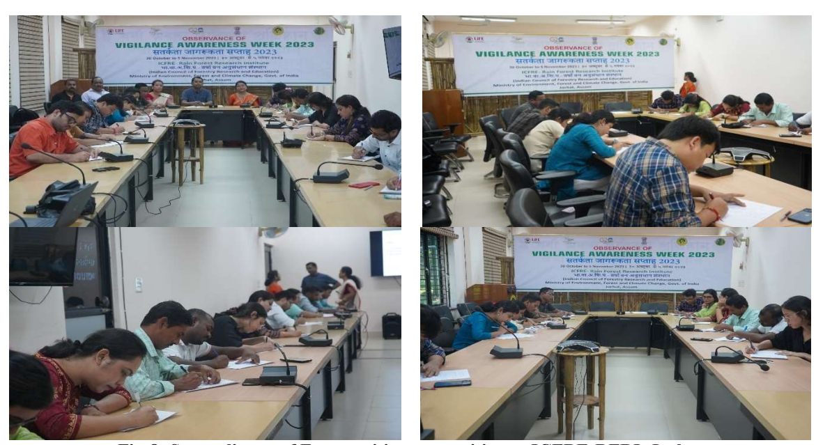
Fig-8: Some glimses of Essay writing competition at ICFRE-RFRI, Jorhat

ICFRE-RFRI conducted Rhyme/ Jingle competition, Essay Writing Competition, Elocution Competition and Quiz Competition on the occasion of Vigilance Awareness Week-2023. All scientists, officers, technical staff, administrative staff, JPF, JRF, RA and other project staff participated in the competition very actively. All the winners of the competitions are awarded. Information on PIDPI and Vigilance Awareness are also disseminated among the students and faculty members of J.B.college on this occasion. Some of the glimpses of various competitions are given below.