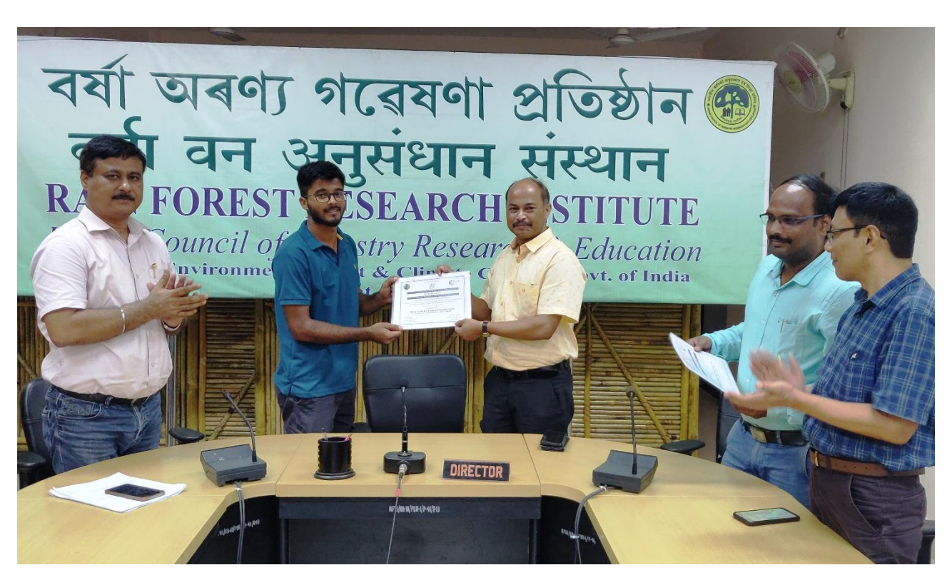
Certificate distribution to the Interns