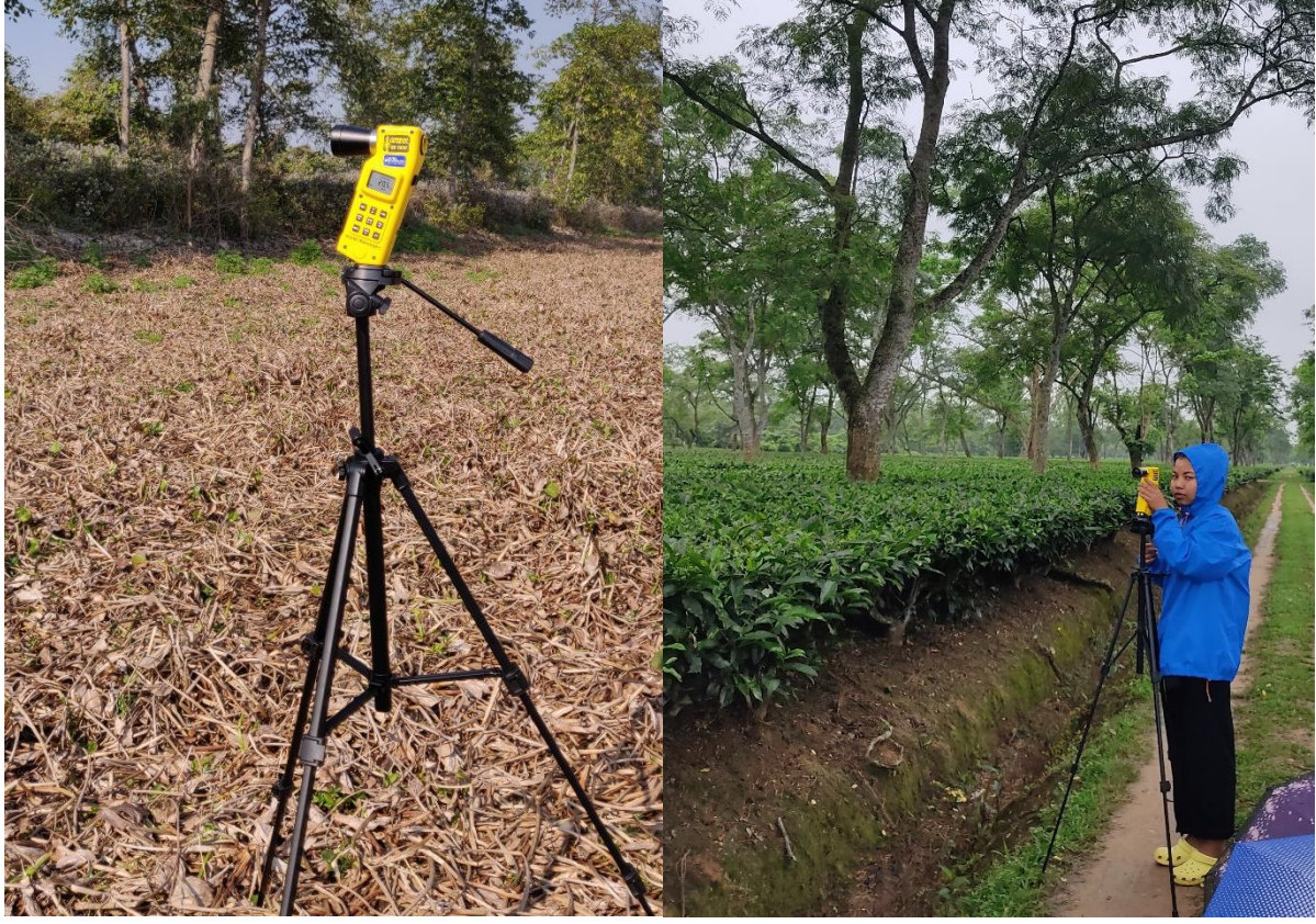
Use of Basal Area Factor Scope (Dendrometer) in measuring the trees