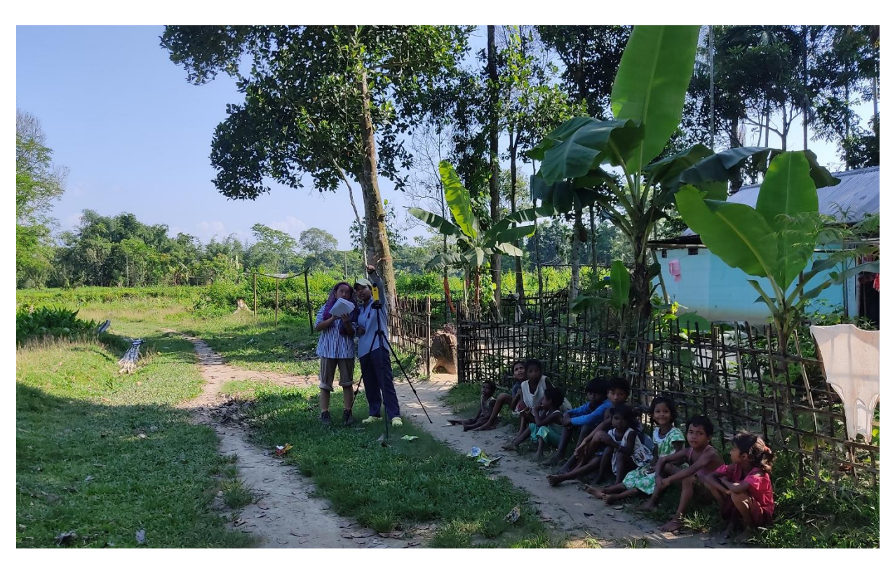
Measuring of trees in Tea garden and homestead areas